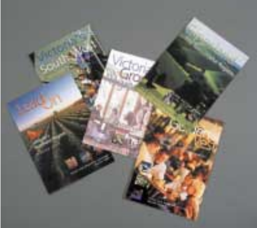
The five Rural and Regional Action Plans were launched in March