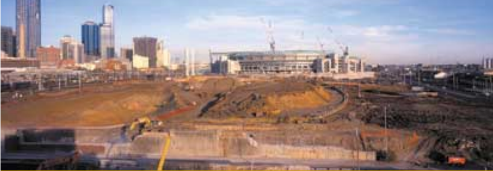
The new North South Road running between the Colonial Stadium and Spencer Street Railway Station