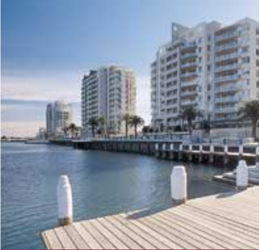
Beacon Cove, Kensington Banks