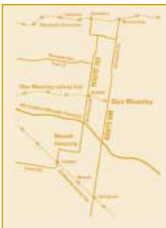
Initial Smart Bus demonstration routes: Springvale and Blackburn Roads

DOI has completed a review of the Victorian marine legislative scheme. The Marine Act 1988 and subordinate legislation are the primary legislation regulating marine safety in Victoria and one of three Acts regulating marine pollution in State waters. The legislation is complex, prescriptive and extensive. A key recommendation of the review is that a new modern Act be drafted and introduced in early 2000. Consultation on review recommendations with key stakeholders has been completed and the first stage of preparing drafting instructions for a new Act has begun.