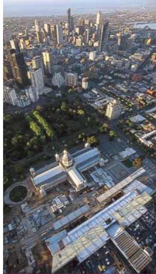
The new Melbourne Museum in Carlton Gardens

The 20 active projects currently handled by OMP have an overall capital value of in excess of $2 billion